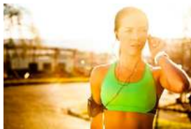
21 Bad Habits You Should Toss Out Today