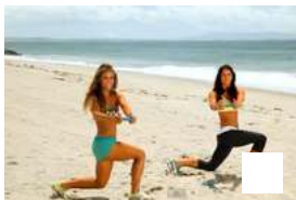
4 Simple Moves for a Bikini Ready Body