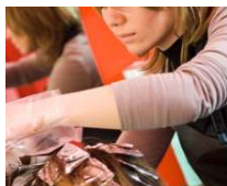
The Latest In Gray Hair Solutions eSalon