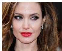
8 Makeup Basics for Green Eyes | eHow eHow