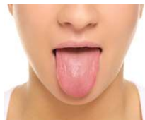
Women: What Your Tongue Says About Your Thyroid Newsmax