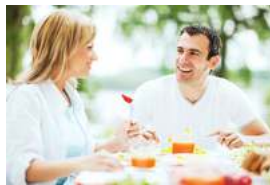
28 Eating Secrets to Help You Lose Weight