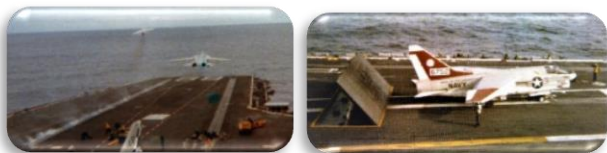
(USS D. D. “IKE” CVN 69)

I always hoped the priest or leader was wrong and God’s word was true, but I had nowhere to turn. I was a good kid growing up but after high school, and then during my tour of duty in the Navy,